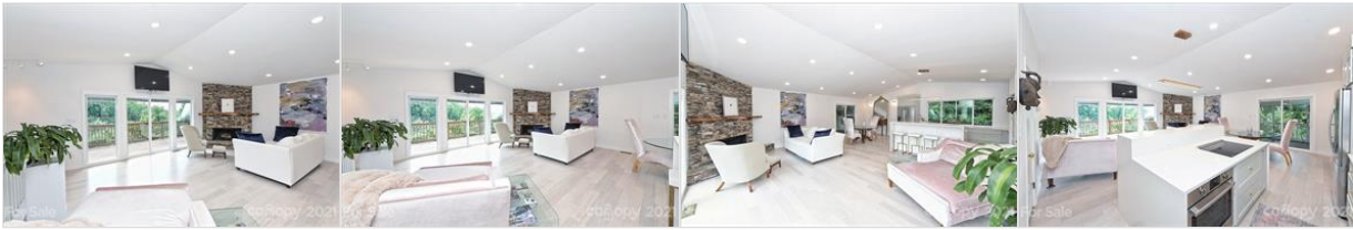
Stunning bright and open, modern yet rustic, great room, kitchen and dining room that was completely remodeled including removal of walls and popcorn ceilings. This level is so bright and open and flooded with natural light and offers stunning views!