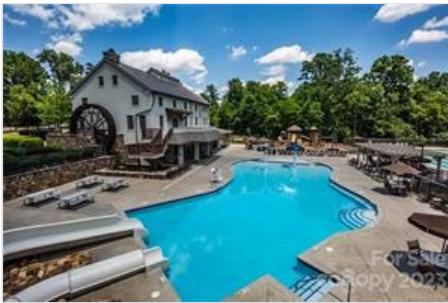
3 Outdoor Pools, Waterslides