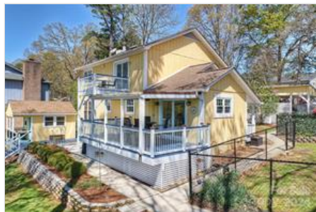
Exterior view of home