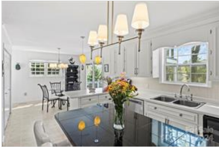
Open kitchen and breakfast area with beautiful views