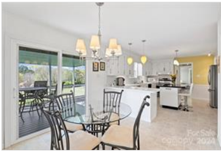
Breakfast area opens to covered porch and kitchen