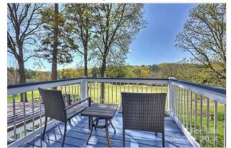
Primary bedroom deck