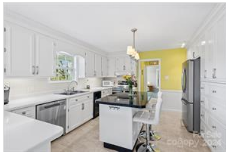
Kitchen with lots of cabinets and newer stainless appliances.