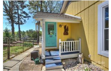
Back door that enters into kitchen