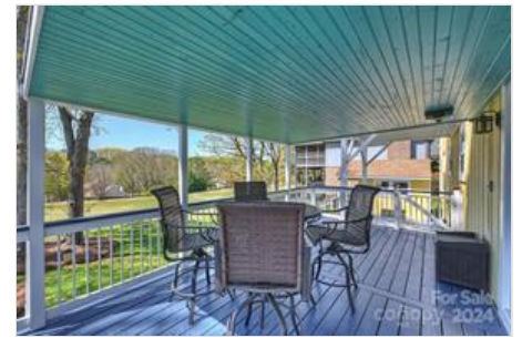
Covered porch overlooking golf course