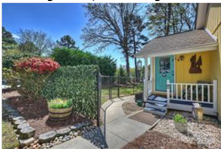
Private front yard