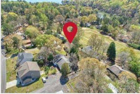
Aerial view of home with Lake Wylie in the background on the right