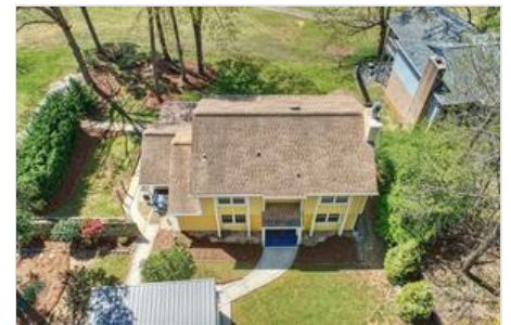
Aerial view of home and lot