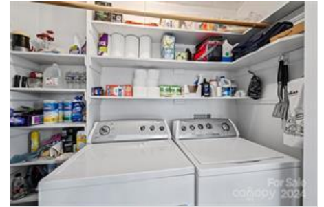
Laundry closet with lots of storage