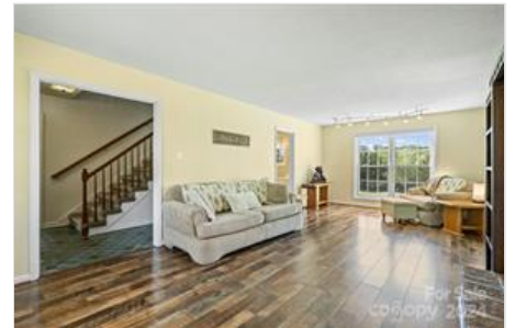
Great room and dining area