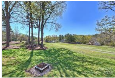
Back yard overlooking golf course