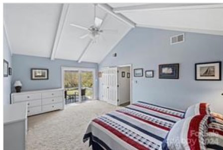
Primary bedroom with attached deck