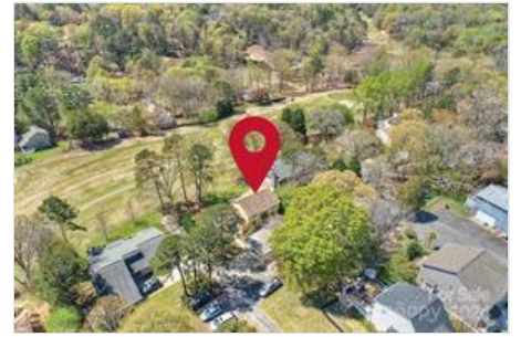
Aerial view of home overlooking golf course