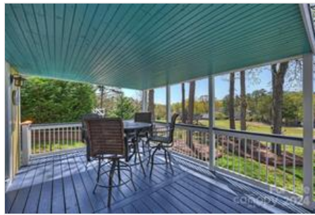
Covered porch overlooking golf course