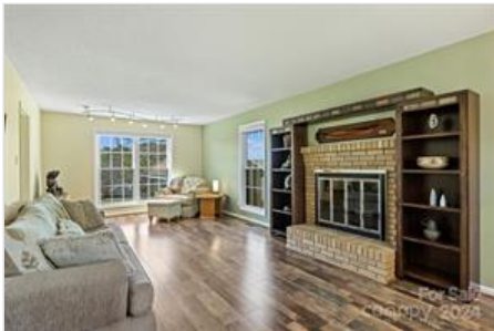
Great room with fireplace and dining area