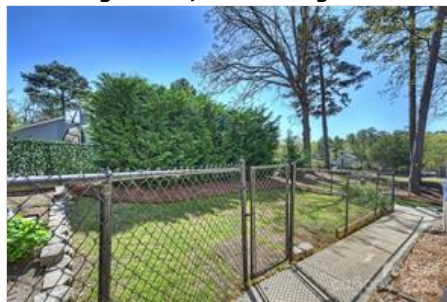
Fenced section of backyard, perfect play area or pet area