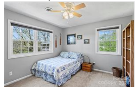
Secondary bedroom with beautiful golf course views