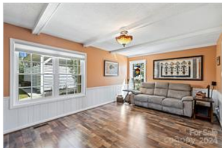
Family room with beamed ceilings and lots of windows